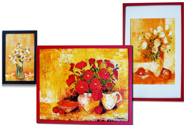
Paintings from the exhibition „Rays of light“.